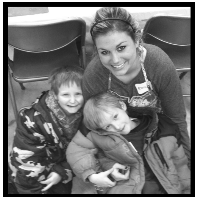
Volunteers at Clen-Moore's annual Community Christmas Dinner served more than 150 grateful people.